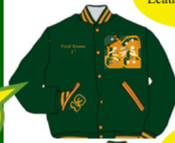
Women's Leather Sleeve