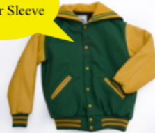
Men's Leather Sleeve