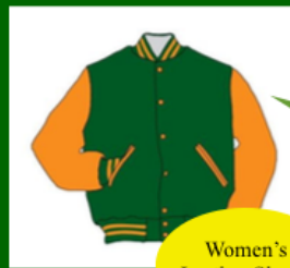
Women's Wool Sleeve

visit us on the web: www.shopallamericansports.com